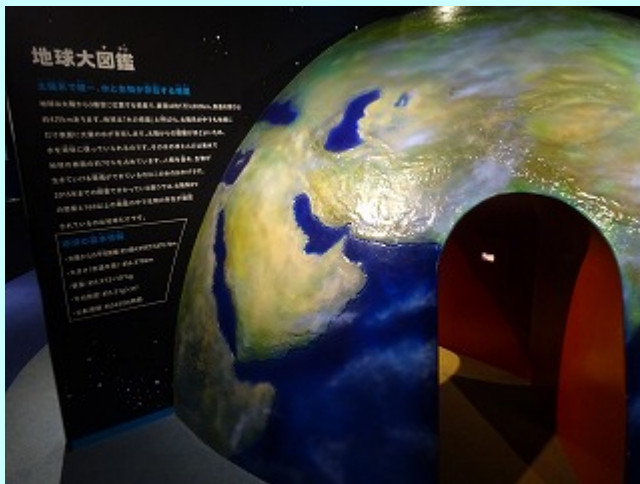
Illustrated Book of the World