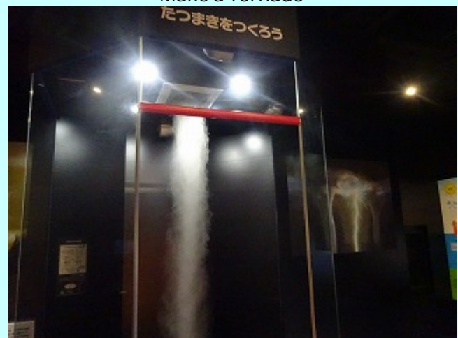
Make a Tornado