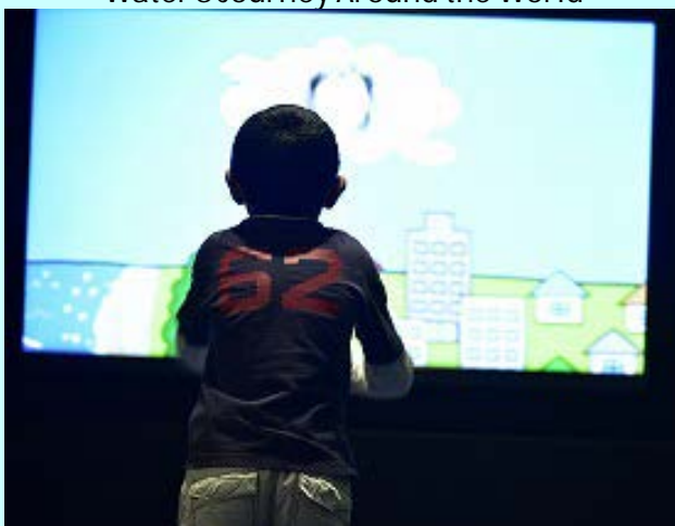
Water's Journey Around the World